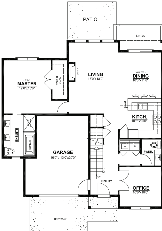
Main Floor 1196 Sq Ft